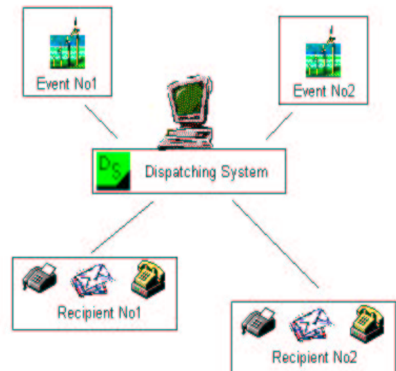
Figure 1. Dispatch System.

The main purpose of Integrated Dispatch System is to send an appropriate message using different means of communication in order to notify given recipients. Dispatching processes are initialized by external events (from the application point of view) that are received by the system.